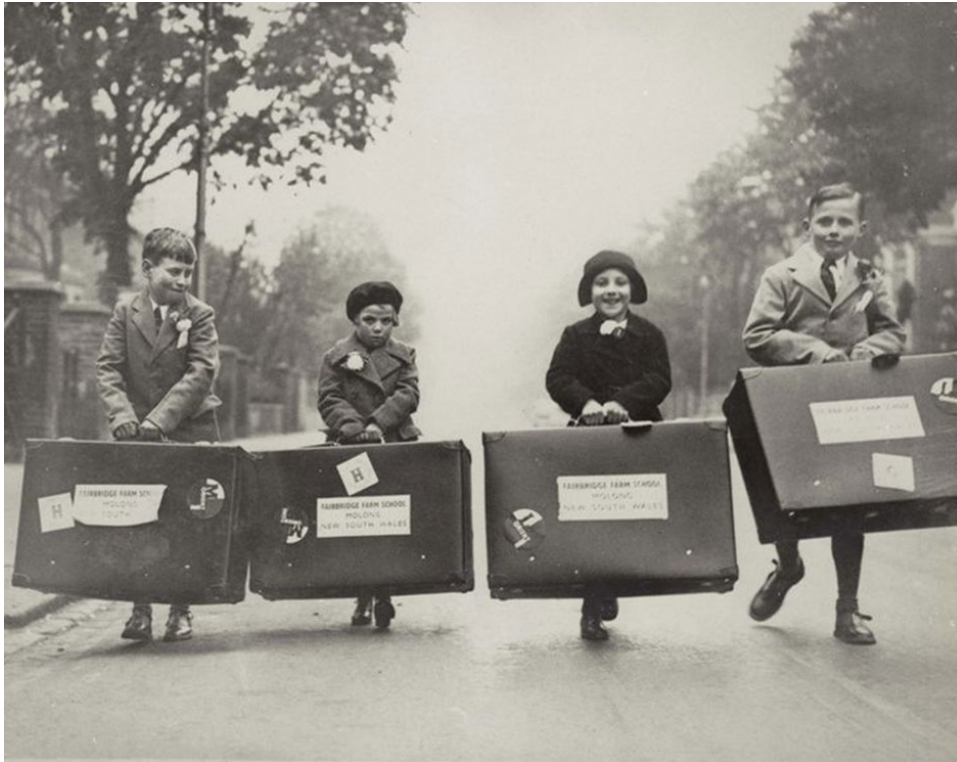
Image: Four children bound for Fairbridge Farm School, Molong 1938.

Using the image of the children above, have the students estimate the size of the suitcases the children are carrying.