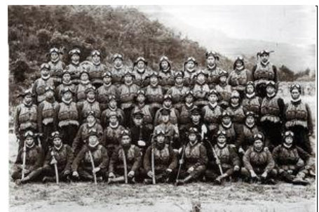
Fukuryu squad

Diving as a fukuryu was a fight against loneliness, especially since it meant continuously waiting for enemy landing ships before a violent, self-inflicted death.