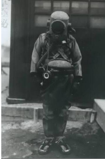
Fukuryu diver (Naver)

When a fukuryu diver was not able to make it, they were expected to swim behind the enemy in land and still carry out a suicide attack. Supposing this, the fukuryu focused on training of swimming technique, building up stamina, and training for mental strength. According to