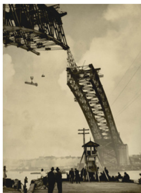
Arch in the Sky by Harold Cazneaux, 1930. Australian National Maritime Museum Collection.